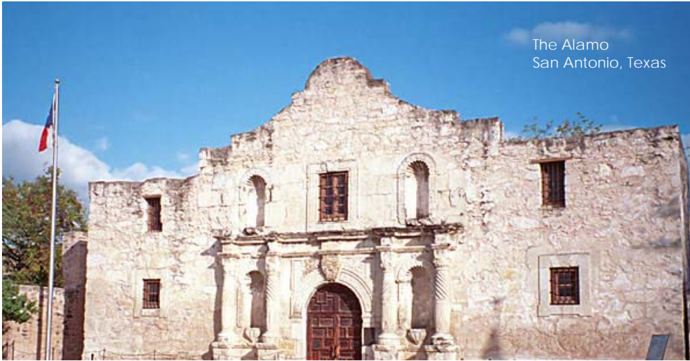
The Alamo San Antonio, Texas